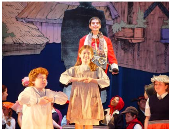
NYC production of Brundibar with the YPC