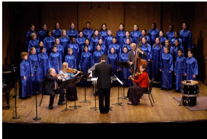
The Young People's Chorus in concert at the 92 nd Street Y April 2003

Maurice Sendak received the 1964 Caldecott Medal for "Where the Wild Things Are." In 1970 he received the international Hans Christian Andersen Medal for Illustration, in 1983 he received the Laura Ingalls Wilder Award from the American Library Association, and in 1996 he received a National Medal of Arts in recognition of his contribution to the arts in America. In March 2003, Sendak received the first Astrid Lindgren Memorial Award, an annual international prize for children's literature established by the Swedish government.