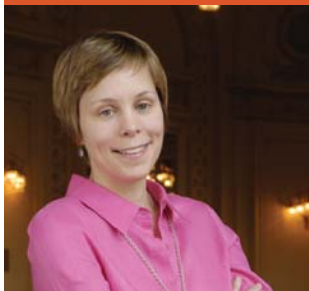
Augusta Read Thomas

A contemporary classical composer and conductor, NICO MUHLY was born in Vermont in 1981. After graduating from Columbia University and earning a Masters Degree in Music from Juilliard, he worked on various composing and film scoring projects. His abilities to move from genre to genre led to his working with such well known names in the music world as Philip Glass, Björk, Antony (of Antony & the Johnsons), Bonnie "Prince" Billy, and most recently Stephen Petronio. In 2006, his debut recording Speaks Volumes was released followed in 2008 by a collection of his collaborations with other artists titled Ekvilibrium .